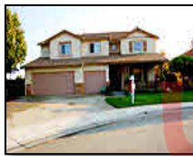
870 Kramer Ct, Brentwood 2746 Sq ft, 4 Bedrooms plus office, 3 full baths inground pool w/ waterfall huge kitchen, upgraded tile counters and floors $484,900