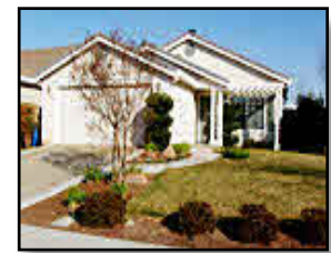
2010 Trailside Dr, Brentwood 1096 sq ft, 3 beds, 2 baths former model home with decorator touches and dine in kitchen! $299,999