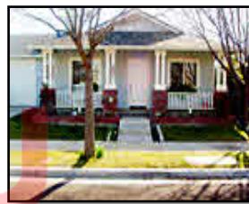
4682 Roosevelt, Brentwood 1591 sq ft, 3 beds, 2 baths master retreat, private Backyard large kitchen, upgraded tile floors formal liv/din rooms! $319,999