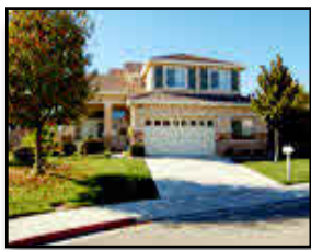
2000 Big Oak Ct, Antioch Master Retreat, 2.5 Baths 2604 sq ft, Located on a court, Community Pool and Tennis! $449,000